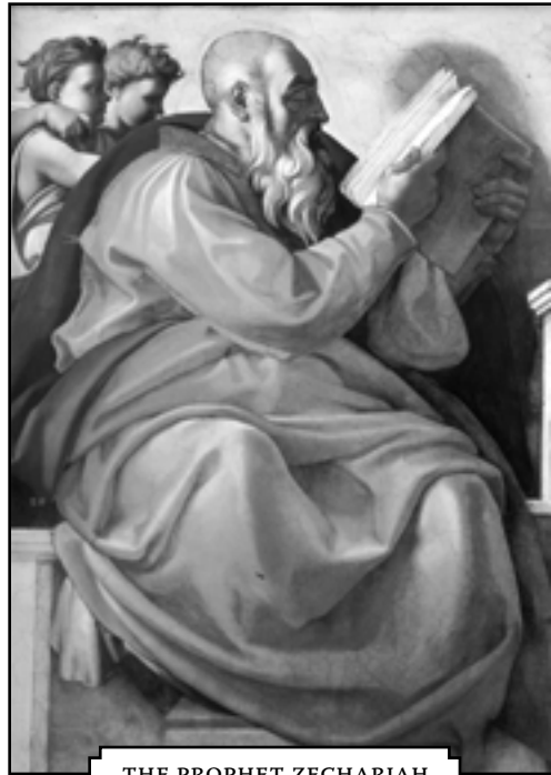
THE PROPHET ZECHARIAH

The following exposition of Zechariah 12 (an abridgment of a longer and more complete article) argues for a fulfillment after the Babylonian captivity when 50,000 Jews had returned to their homeland to rebuild the temple and the city of Jerusalem.