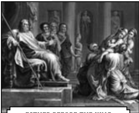
ESTHER BEFORE THE KING

We learn from Esther that the Jews were rescued from their enemies in a dramatic and decisive way. First, Haman, “the enemy of the Jews,” is hanged (7:10; 9:25), and his ten sons were later executed (9:7–9). Second, “on the day when the enemies of the Jews hoped to gain the mastery over them, it was turned to the contrary so that the Jews themselves gained the mastery over those who hated them” (9:1). Third, we are