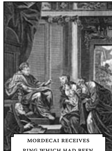
MORDECAI RECEIVES RING WHICH HAD BEEN GIVEN TO HAMAN