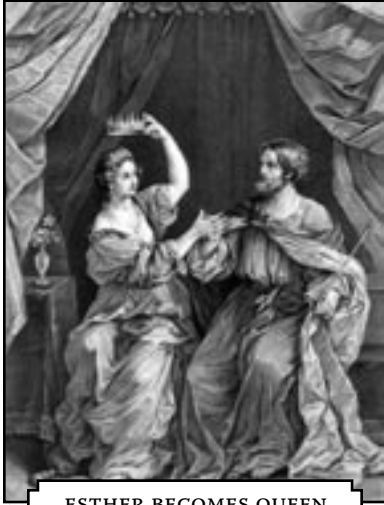
ESTHER BECOMES QUEEN

as “the enemies of Judah” (Ezra 4:1). “Then the people of the land discouraged the people of Judah and frightened them from building, and hired counselors against