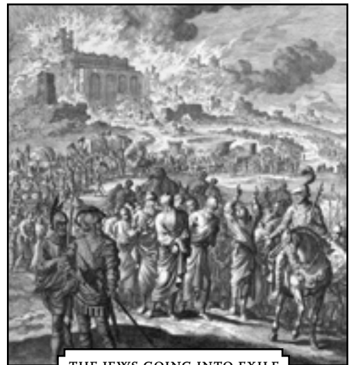
THE JEWS GOING INTO EXILE

There was early opposition to the returning exiles and their building program. The opposition groups are described by Ezra